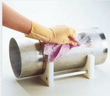
While wearing gloves, use the abrasive side of the wipe to remove contaminants from the pipe or other surface to be cleaned