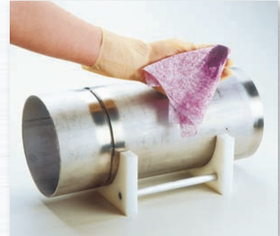
Use the smooth side to re-wipe the surface, ensuring all impurities are removed